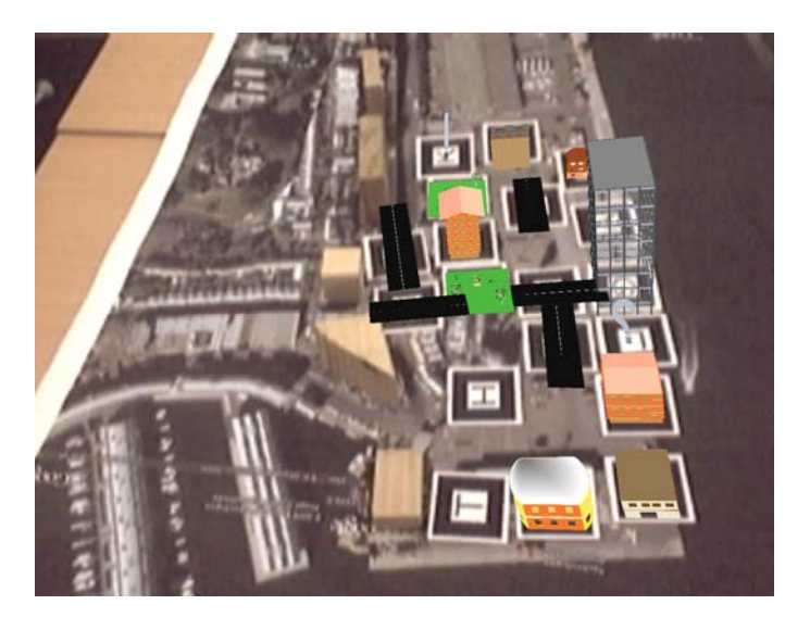
Figure 2: Screenshot of an AR system for urban design.

This project entails the concrete implementation for some ideas described in Sample 1. Students developed an AR-based planning system that allows participants to acquire more detailed visual information from virtual models, as well as real time manipulations on the layout design in a real and familiar workspace (see Figure 2).