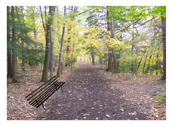
Figure 3: A virtual bench is positioned onto the proposed location in the real environment.

Through head-mounted displays, participants could see a composite image of the virtual object and the real world into which they could add objects with a tablet PC. The system allows designers to collaborate off paper or screen and design in a real environment. It has further applications into other more specific and general design and urban planning areas.